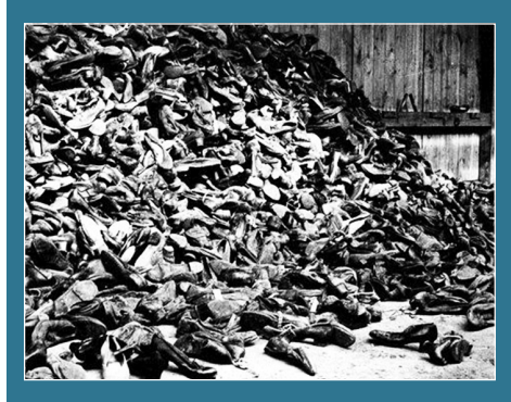
A pile of victims' shoes, Majdanek, Poland.